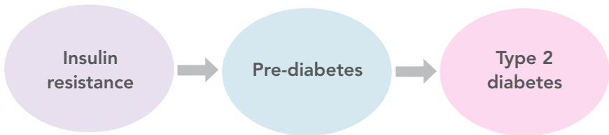
Diagram 3: the transition from insulin resistance to diabetes